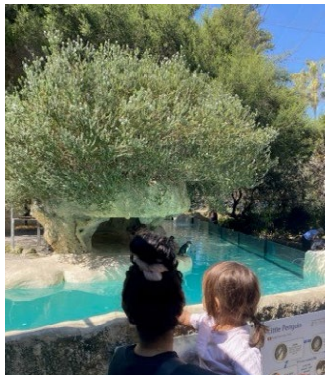
▲ A young mother and her child enjoy a visit to the Zoo, made possible through Mineral Resources' support for Horizon House recreation activities

"Expanding access to these activities of enriching experiences for all of our young people at Horizon House would give them the chance to explore new horizons, build connections and enjoy opportunities they may have never had before. It's also a wonderful reminder that they are not alone on their journey."